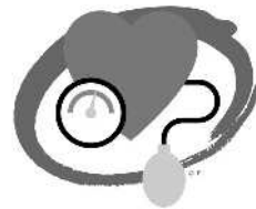
BLOOD PRESSURE SCREENINGS

Anointing of the Sick will take place at St. James immediately following all Masses during the weekend of January 31st and February 1st. Parishioners will be invited to remain in their seats following Mass if they wish to be anointed. If you are unable to attend and wish to receive the sacrament, please contact the parish office.