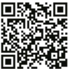
Facebook QR Code